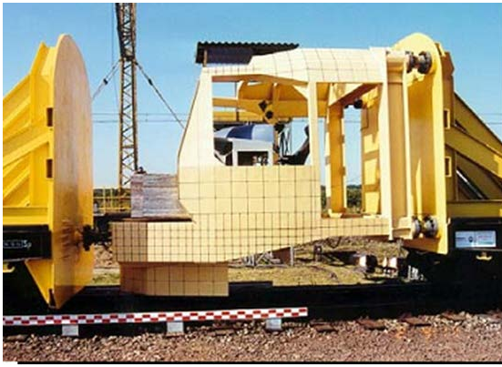
Figure 4. The locomotive model for carrying out a crash test