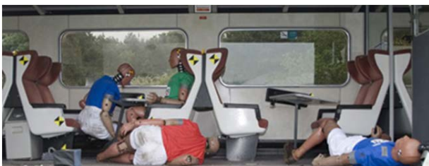
Figure 7. Train Interior Passive Safety – after testing

Mentioned data show expediency of creation of special grounds for check of passive safety of the rolling stock of railway. At the same time, development of such direction requires development of corresponding methods and techniques, mathematical, computer and physical models.