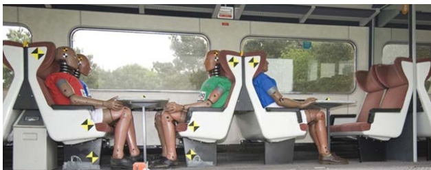
Figure 6. Train Interior Passive Safety – before testing

Safety of the locomotive driver and passengers can be also optimized by means of numerical modeling and practical tests with human models. Interaction between interior objects of passenger carriages and passengers in case of clash is determined by means of computer modeling on human models (Fig. 6, Fig. 7). Special program developments allow designing systems of control.