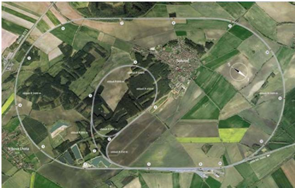
Figure 2. Testing ground Test Centre VUZ Velim