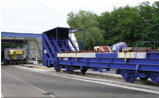
Figure 5. Clash of the rolling stock at railway crossing

Safety of the locomotive driver and passengers can be also optimized by means of numerical modeling and practical tests with human models. Interaction between interior objects of passenger carriages and passengers in case of clash is determined by means of computer modeling on human models (Fig. 6, Fig. 7). Special program developments allow designing systems of control.