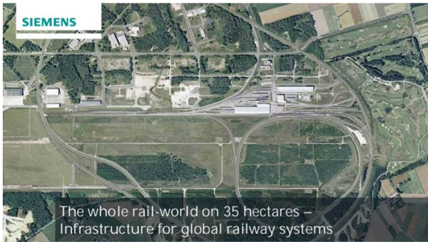
Figure 1. Testing ground Siemens

with the European legislation on the basis of analysis results of appropriate experience of the European countries, and also determination of features of these measures implementation.