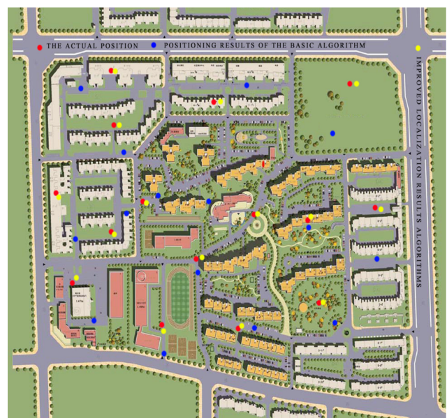
Figure 4. Positioning the test results on the 2nd experiment area