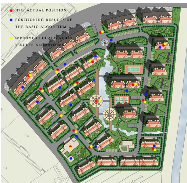
Figure 3. Positioning the test results on the 1st test area

In order to verify the effectiveness of the improved algorithm proposed in this paper, we will do simulation experiments. Within a two experimental area, algorithm GSM network positioning test of standard BP neural network algorithm and improved BP neural network. The results are as follows: