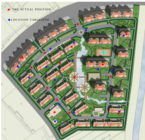
Figure 1. The results based on the GSM network positioning BP neural network

By using the BP neural network algorithm to the GSM network positioning, the positioning result is shown in the following figure.